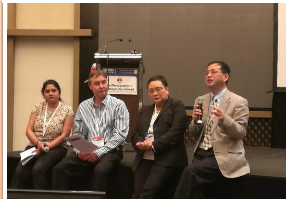
FOP WORKSHOP Q&A SESSION